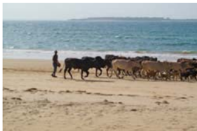
Figure 11. Cattle near Ruvula Village

Livestock in MBREMP is fairly small-scale, primarily for economic reasons. Farming is seasonal and generally limited by poor soil conditions and insufficient rainfall. This situation increases local dependence on the Park's marine resources. However, there is potential for agricultural and livestock development if the areas associated with the wetland system of the Ruvuma River and Delta are properly utilised.