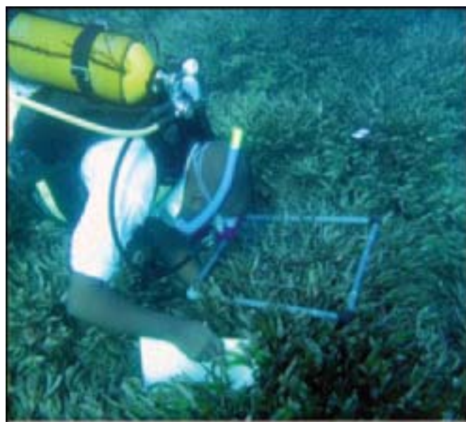
MBREMP development has included extensive biological surveys to assess the status of the Park's marine resources.

The geology of the Park is primarily sedimentary deposits from the Jurassic and Lower Cretaceous periods (approximately 150 million years ago). Within one hundred kilometres of the coast rise the slopes of the Makonde Plateau, over 500 metres above sea level. The Makonde Plateau extends into Mozambique but is bisected by the Ruvuma River, draining Lake Nyasa, as well as a large part of northwest Mozambique through the river's largest tributary, the Lugenda River.