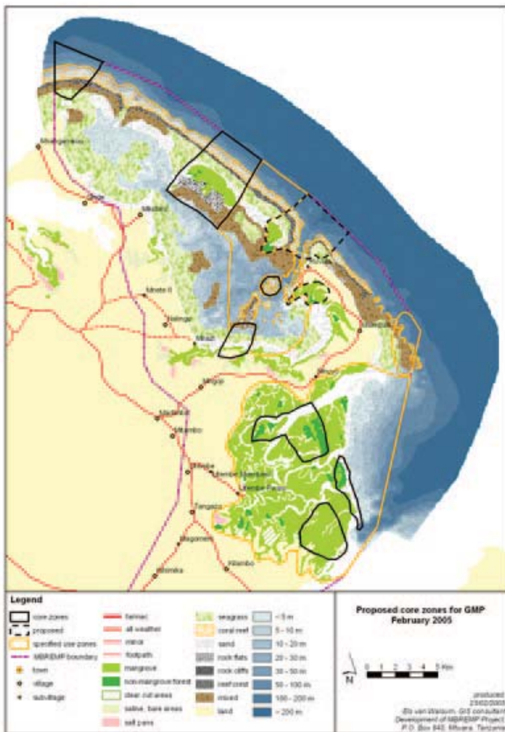
Map 3. Core and Specified Use Zones for Mnazi Bay Ruvuma Estuary Marine Park