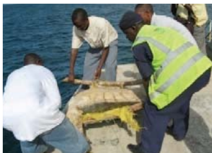
Releasing a Green turtle captured by poacher.

In marine areas adjacent to the Park, especially around Ras-Msangamkuu, residents have been known to break off live corals from the seabed for use in lime production. The main types of coral used are the massive, slow growing corals of the Porites genus, which are ecologically important in reducing wave action and providing the base for reef growth. Continued extraction of these corals can destroy reefs, lead to increased erosion of the adjacent coastlines, and the eventual decline of local fish stocks. A related environmental impact of lime production is the deforestation caused by uncontrolled harvest of trees to feed the kilns that are used to burn the coral. Deforestation leads to increased soil erosion, which in turn affects the Park's marine environment through increased sedimentation in coral and seagrass habitats.