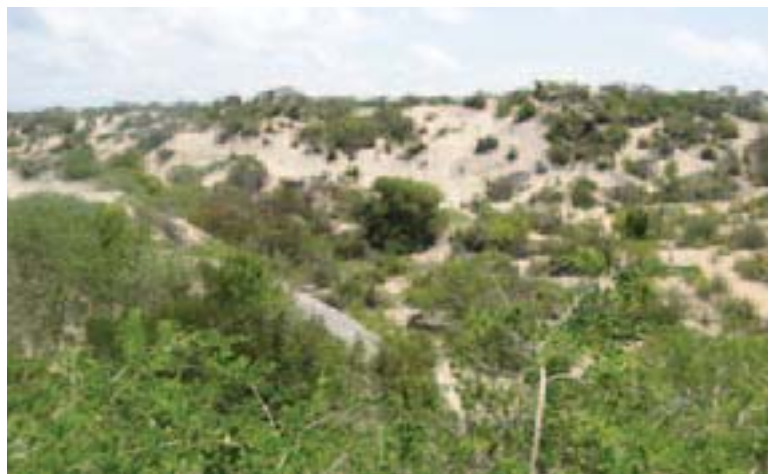
Figure 4: Sand banks which are very attractive and are also turtle nesting sites

Sand beaches are common within the Park and occur in two main areas. A twelve-kilometre section of beach runs along the eastern shores of the Msimbati Peninsula and around Ruvula. Strong currents between Lijombe and Ras Mivinjeni lagoons are creating visible beach erosion problems, including parts of local coconut plantations. A more sheltered, fifteen-kilometre section of beach runs continuous along part of Sinda and Mnazi Bays. Vast expanses of open sand are also exposed during low tides in central parts of Sinda Bay to Mnazi Village and between Namponda and Membelwa Islands. These intertidal areas greatly contribute to the diversity of habitats in the Park.