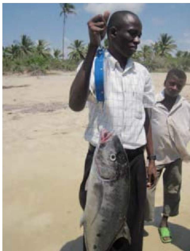
Figure 12: Monitoring of fish catch per unit effort in the park

Overfishing results from several factors, including increases in the numbers of fishers, new and "improved" gear types that result in higher catch rates (e.g., ringnets) and destructive fishing practices (e.g., dynamite fishing and using nets with tiny mesh sizes, like mosquito nets). These factors are interconnected. For example, as the number of fishers operating within the Park increase and the catch per fisher is reduced, fishers are more likely to adopt either improved gear types or destructive fishing practices in order to maintain their existing levels of income. The issue of fishing pressure is compounded by the fact that both Park residents and migratory fishers operate within the Park. Local fishers often fish on subsistence basis and generally are not as well equipped as migratory fishers, who fish for commercial purposes. Local opinion is that migratory fishers catch more fish than locals due to these advantages. Migratory fishers commonly acknowledge that they fish in MBREMP because their home fishing grounds are overfished.