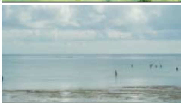
(A) Canoe fishers sell their catch at the end of the day, near Mnazi Village. (B) Dhow of Ruvula Beach. (C) Basket trap overgrown with corals in Mnazi Bay. (D) Residents gather shellfish and octopus during low tide, near Msimbati Village.

More than just a geographical entity, MBREMP is home to more than 44,000 Tanzanians, living in seventeen villages. Park residents are highly dependent on local marine resources for their livelihood, in terms of both food and income. Men and women widely engage in fishing, gathering shellfish, sea cucumbers, and octopus during low tide, and harvesting timber from the mangrove forests.