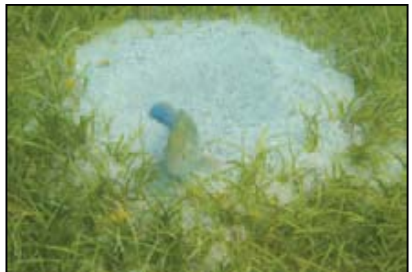
Seagrass beds serve as important feeding and spawning habitat for numerous fish species. Top photo: Great barracuda ( Sphyrna barracuda ) prowl the seagrass beds along Msimbati Channel. Bottom photo: A sky emperor ( Lethrinus mahsena ) guards her spawning red.