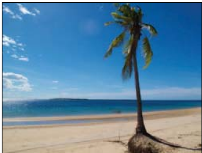
Msimbati Channel and Namponda Island, viewed from Ruvula Beach.

The edge of a rocky limestone platform extends, in two sections, for about 25 kilometres along the outer perimeter of the Park from Ras Msangamkuu in the north to the Ruvuma Estuary at the Mozambique border, bisected by Msimbati Channel. This feature was produced by past coral reef growth, mainly during the Pleistocene epoch (within the last million years), which has since been uplifted. The shorter, southern portion of the ledge runs from east of Msimbati Village, through Lijombe lagoon, to Ras Ruvula. The northern platform extends 20 kilometres, from Namponda Island on the northern side of Msimbati Channel to Ras Msangamkuu, including Membelwa Island.