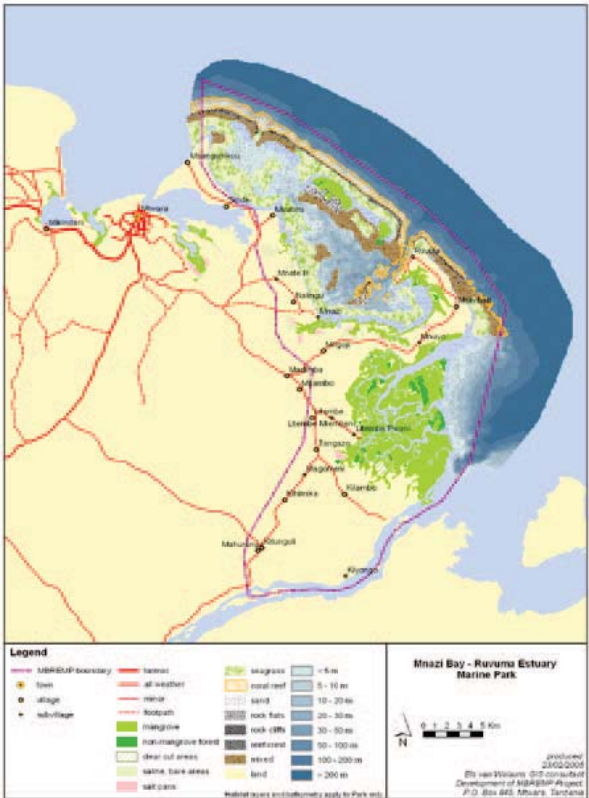
Fig. 2. A map of Mnazi Bay Ruvuma Estuary Marine Park showing bathymetry and habitat types

The patch reef closest to Namponda is called Chamba cha Lusale, and is irregularly shaped, about a thousand metres wide, with reef slopes extending 25 metres to the sandy bottom. The other two patch reefs, Chamba cha Chumbo and Ilili, have rocky coral outcrops exposed during extreme low tides, and run to a depth of nine to sixteen metres. Numerous small coral patch reefs are scattered in the shallower waters (five to nine metres deep) amongst these larger reefs. One of the most distinctive and probably the largest of these smaller patch reefs is Matenga, near the existing gas well off Ruvula Peninsula. The water in the shallow southern part of Mnazi Bay is generally more turbid than other parts of the Bay, due to inputs from three small mangrove creeks (Mnazi, Kilindi and Mlamba) and the muddy surrounding intertidal area.