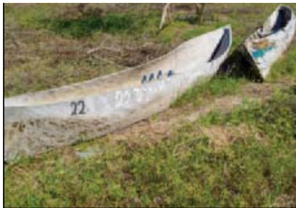
Gears and crafts confiscated through MBREMP enforcement efforts against illegal fishing practices.

Dynamite fishing is still a problem in the Park. However, the practice has generally declined with regular enforcement patrols conducted by Park staff and other stakeholders.