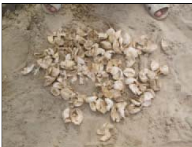
Empty turtle egg shells after hatching