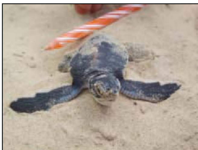
Tracking of sea turtle hatchling.

There are four main turtle nesting sites within the Park: Litokoto, Kingumi, Msimbati, and Msangamkuu beaches. Most nesting occurs between April and August, though green turtles have been reported to nest as early as February. Female turtles usually return to the same beach where they hatched to lay their eggs at night in a shallow pit. After about 60 days, the turtle hatchlings will emerge and immediately take to the sea, where they will feed and grow for up to 40 years before returning to repeat the cycle. Green turtles feed exclusively on seagrass, with the other species also consuming seaweed, sponges, and jellyfish.