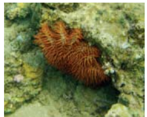
Crown-of-thorn Starfish ( Acanthaster planci )

Though not as commercially important as sea cucumbers, the status of other echinoderms is likewise relevant to the park’s marine biodiversity. Crown-of-thorn starfish ( Acanthaster planci ) feed on live coral polyps, and their over population is commonly seen as a cause of reef degradation. Sea urchins, on the other hand, generally help to maintain coral reef cover by grazing on the macroalgae that can potentially compete with corals for light and space. However, if sea urchin populations grow too large, they may further contribute to reef erosion through feeding and spine abrasion (McClanahan et al. 1996).