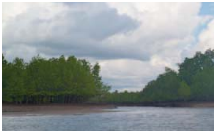
Dense mangrove forests of the Ruvumu Estuary at low tide

Marine biodiversity in mangrove forests is limited to a few species tolerant to muddy conditions, desiccation, and seasonal freshwater flooding. Approximately fifteen species of crustacean and mollusc and twenty species of fish have been documented in MBREMP's mangrove forests. Notable species include mud crabs ( Scylla serrate ), penaeid prawns, fiddler crabs ( Uca spp.), mud snails ( Terebralia palustris ), mullet ( Valamugil sahelii ), and seven-spot herring ( Hilsa kelee ). Unidentified monkeys have been spotted in the forest.